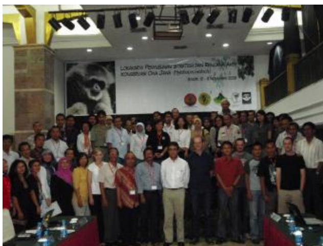
Right: Delegates at the Javan Gibbon Conservation Workshop.