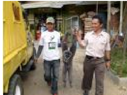
Right: JGC Staff remove a pet gibbon from a local village

The long term aim for gibbons at the Javan Gibbon Centre is that they will be suitable for release. However, the reality is that not all gibbons will be suitable for release. For those gibbons that this is unlikely they will still be paired and encouraged to breed with a view to reintroduction of their offspring into wild habitat.